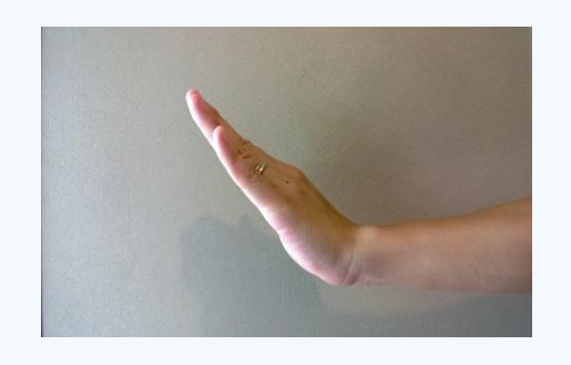
Note A (Re)