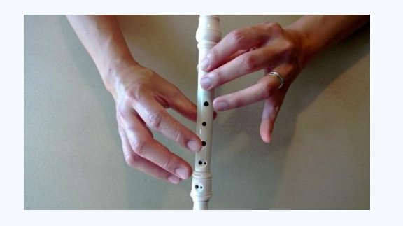
Left Hand Fingers: Front: Pointer & Middle Back: Thumb