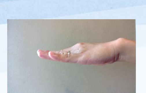
Note B (Mi)