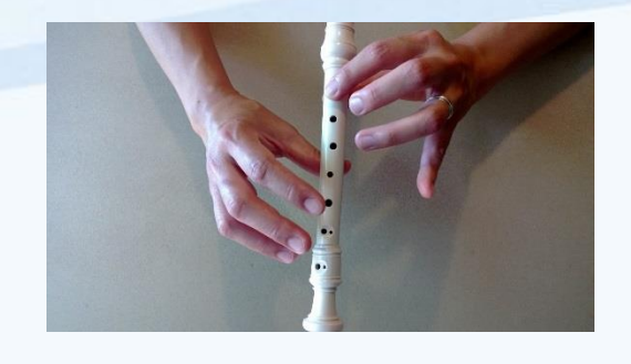
Left Hand Fingers: Front: Pointer Back: Thumb